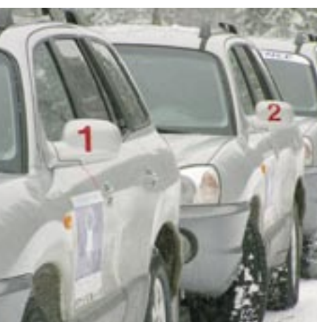
Welcome to the unique nature and culture of Swedish Lapland! We present true wilderness experiences and incentives for groups up to 700 persons.